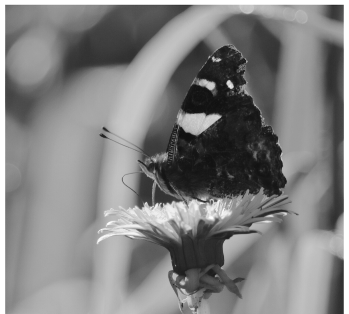
A bumblebee on a small dandelion ( left ); a kahukōwhai with proboscis unfurled ( right ).